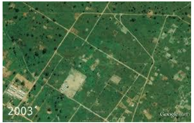
Figure 3: Input Image