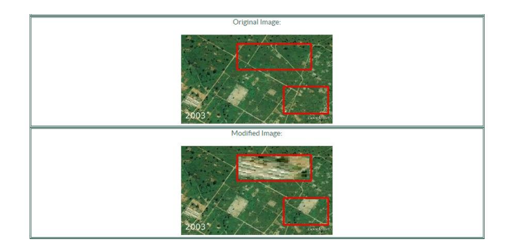
Figure 4: Original Image and Modified Image