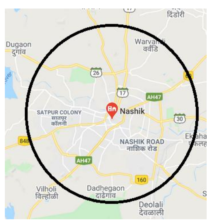
Figure No. 1: Dense urban area selected for the study was 10 km periphery from the center of Nasik city.