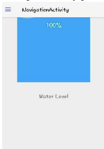
Figure 4: Water level indication in tank