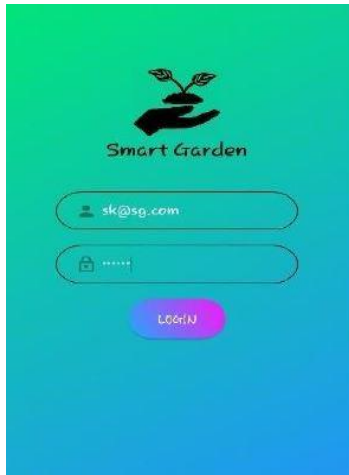
Figure 2: User login