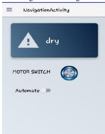
Figure 3: Home page