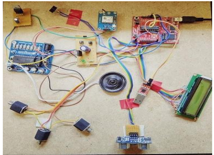
Figure 1 Hardware Implementation of Proposed Device

The above Fig. shows the overall interfacing of the various modules as shown in the circuit diagram. The microcontroller MSP430, GPS module, vibrators, buzzer, ultrasonic sensor etc. are interfaced so as to provide required output i.e. to trace the desired location.