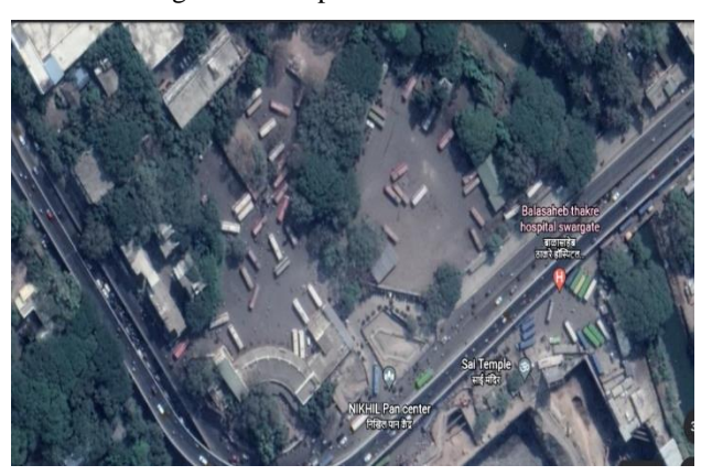
B.Present Condition of Bus Stand

3)Data Analysis: With the help of spss tool we analysis the data and as per data we prepare a revit model of our bus terminal. We get insite of problems